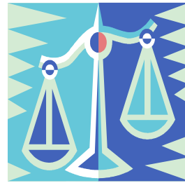
Striving for Equality

welcomes articles to include within the newsletter. Ideas for possible articles would also be appreciated. You can contact The Shenango Valley Urban League at (724)981-5310